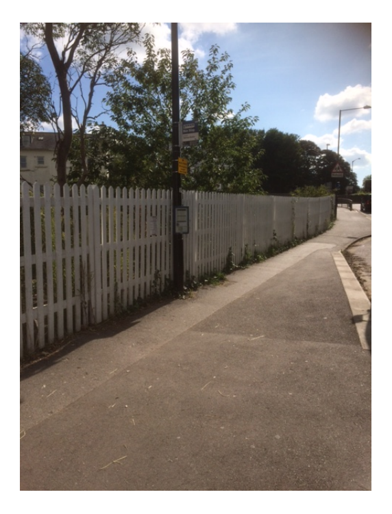
Service 123 bus stop viewing Southward